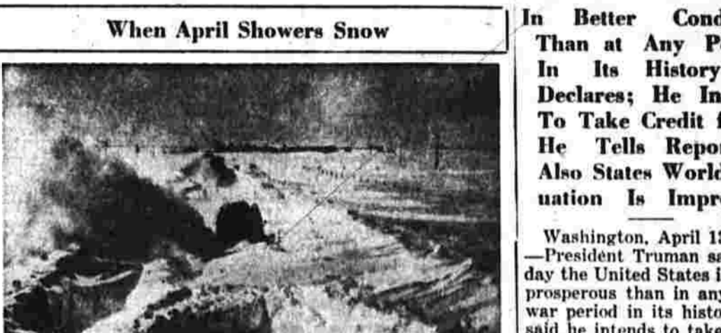
When April Showers Snow

Washington, April 13.—(AP)—President Truman said today the United States is more prosperous than in any post-war period in its history. He said he intends to take credit for it. He said, too, there has been a gradual improvement in the world-wide situation since 1945 which he described as the worst period since the war ended.