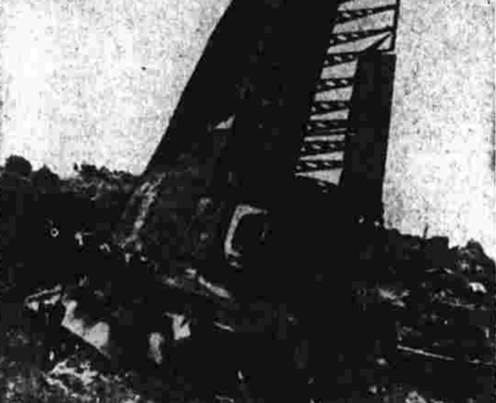
This shattered tail assembly was the largest fragment intact after a B-29 bomber crashed in a remote section of Manila secret weapons base at Alibonque, N. M., killing 13 men aboard. The bomber struck the mountain after taking off from Kirtland base, N. M. The plane was in the 500th bomb wing at Walker base, Roswell, N. M.

The shattered tail assembly was the largest fragment intact after a B-29 bomber crashed in a remote section of Manila secret weapons base at Alibonque, N. M., killing 13 men aboard.